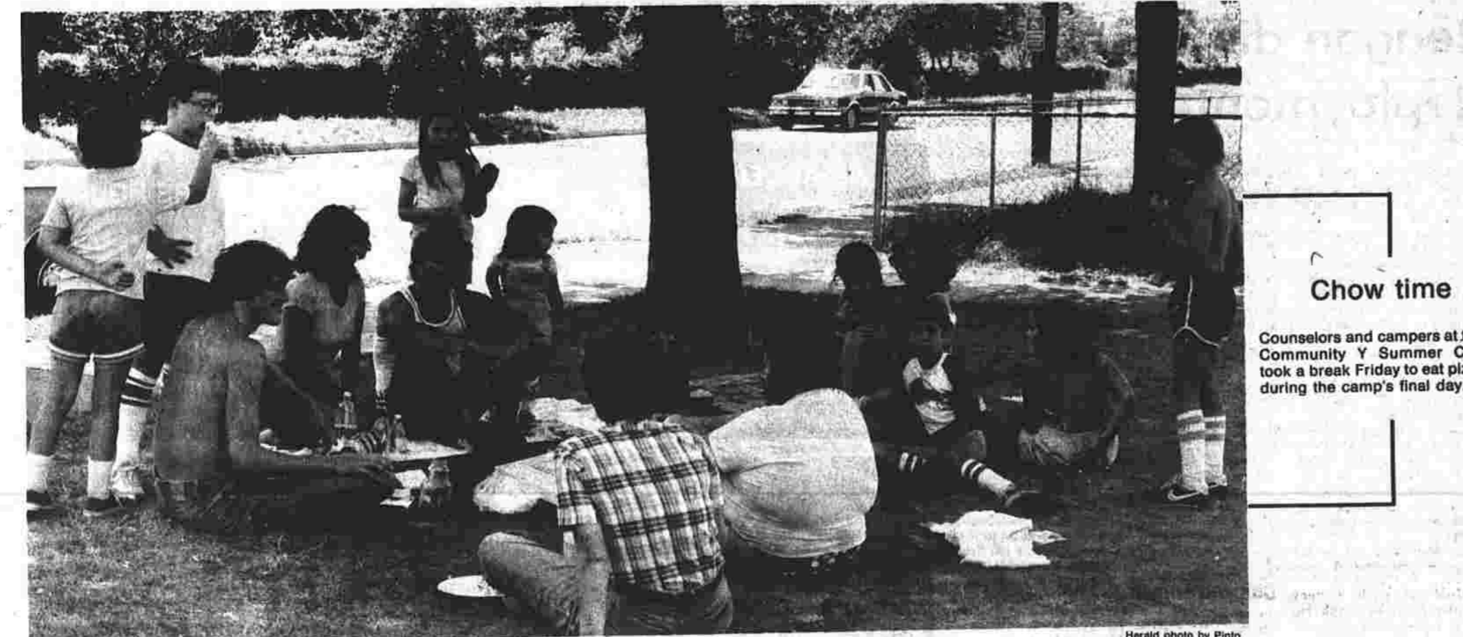
Chow time Counselors and campers at the Community Y Summer Cap took a break Friday to eat pizza during the camp's final day.

require, to protect the neighbors. However, under any circumstances, Penny said the Oct. 6 deadline for a decision, requested by Multi-Circuits, 'will be met.' The subcommittee is hoping to have a proposal ready for the full Board of Directors by its September meeting.